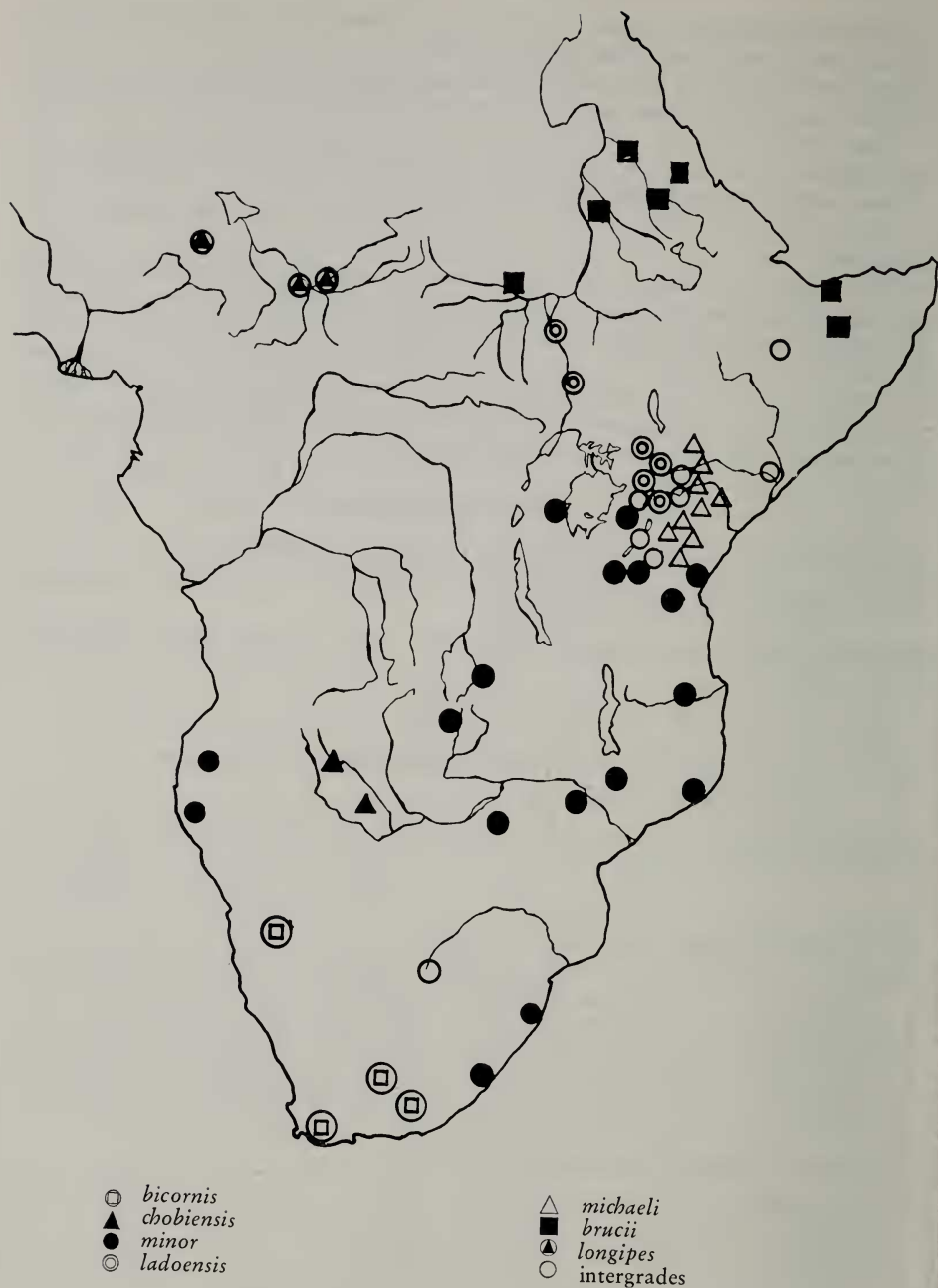
Fig. 2. Distribution of subspecies of Diceros bicornis

1836: Rhinoceros keitloa A. Smith, Rep. Exped. Expl. C. Africa, 44. "Country north and south of Kurrichaine" (Marico district, W. Transvaal). Although probably an intergrade between this race and D. b. minor , this name may be fixed as a synonym of the present race.